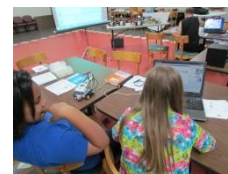
Some class pictures.