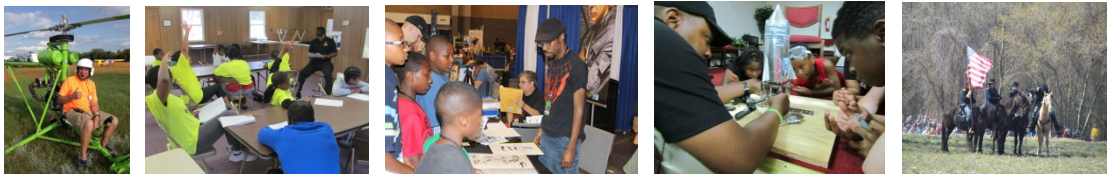
Some upcoming Events for 2015.

Some upcoming events and classes include: